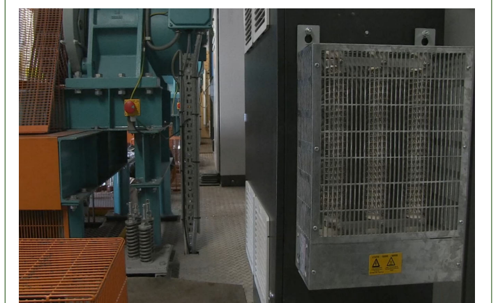
After: Braking Resistors Showing Reduced Loss Of Energy Now Stored By Global Green Gem